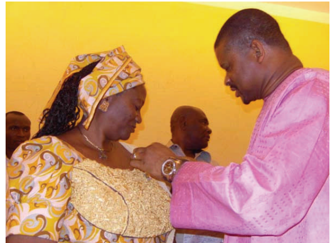
Sen. Engr. Lee Maeba JP, decorating the Honourable Minister of State, Commerce & Industry.