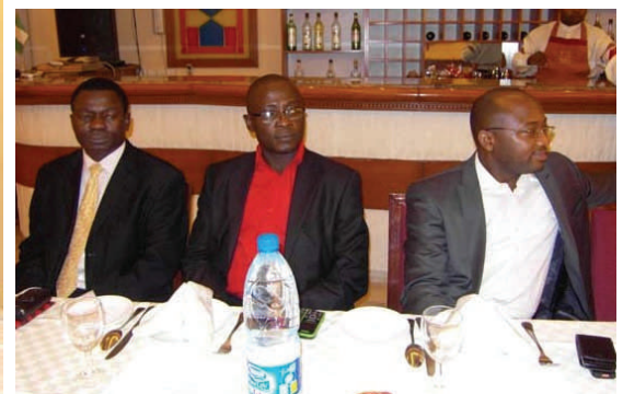
Enebi of SON (middle)