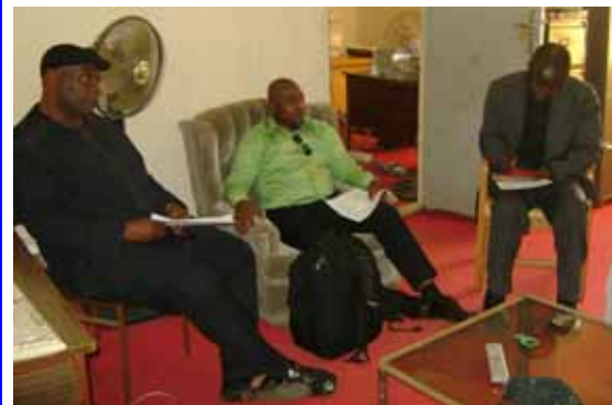
IACE Board of Governors in a meeting on Tuesday 23rd November 2010 in Abuja. The meeting was chaired by the chairman of the institute.